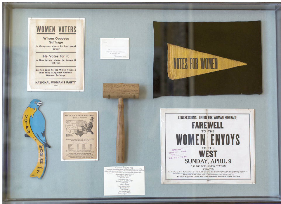
Working with private collectors across the country, the Belmont-Paul National Monument has collected items from the history of the equal right's movement, in order to bring them into the public eye. Pictured: a tin bluebird, meant to be hung in windows as an icon of solidarity, a copy of an early map showing where women could vote in the United States, and a gavel that was used at the founding meeting of the National Women's Party in 1916.